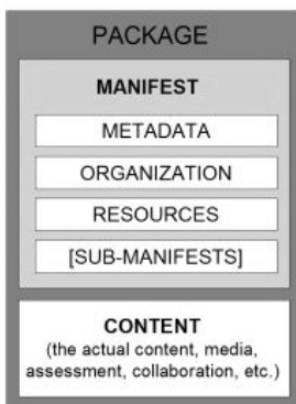
Figure 1: LO Physical Structure (taken from IMS, 2005)

(a) is a straightforward issue, set by LOM and adopted by all standard bodies. For all standards, a LO is a compressed file (e.g. a CAB, TAR, or ZIP file) which contains the content (i.e. the content files) and the metadata, usually coded in XML into a manifest file. The following figure (Figure 1) sketches the structure of a LO according to IMS.